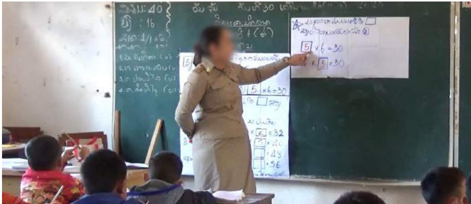
Figure 2. Ordinary language in the Lao PDR classroom

Teacher: This symbolic sentence alternates or swaps places.